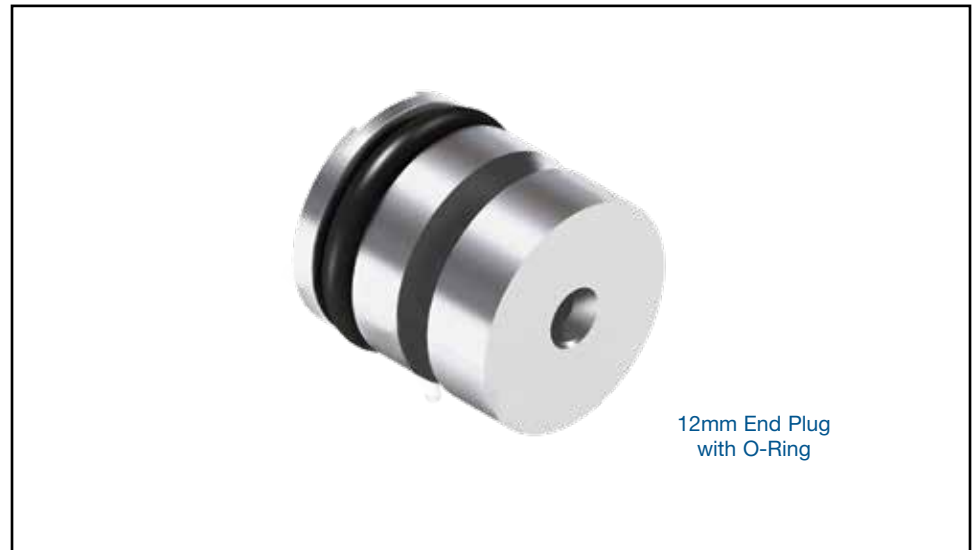
12mm End Plug with O-Ring