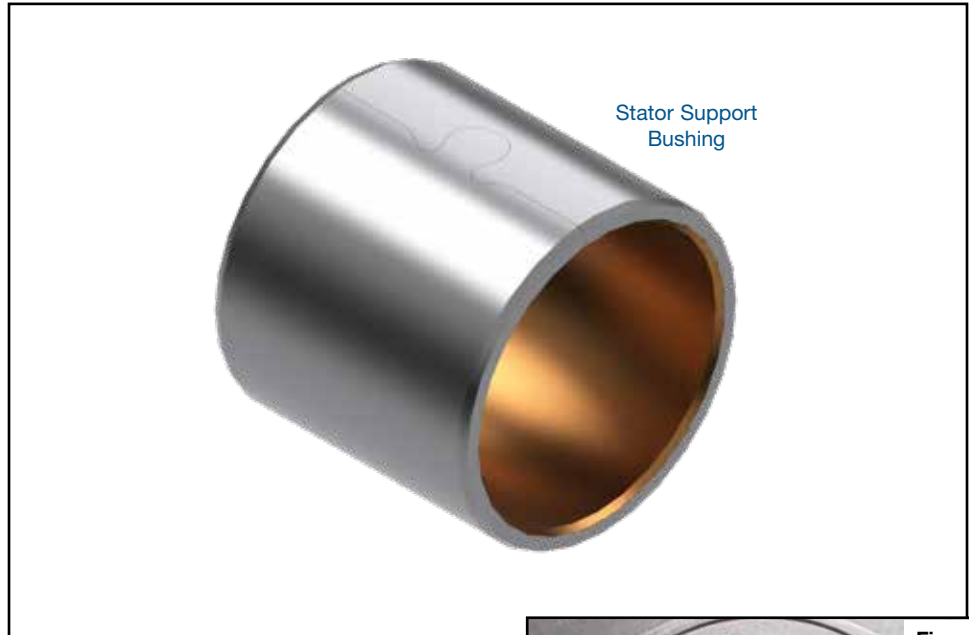
Stator Support Bushing