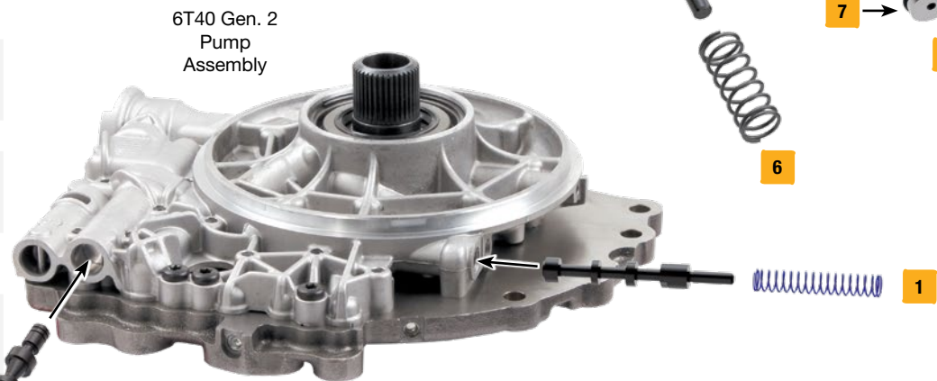
6T40 Gen. 2 Pump Assembly