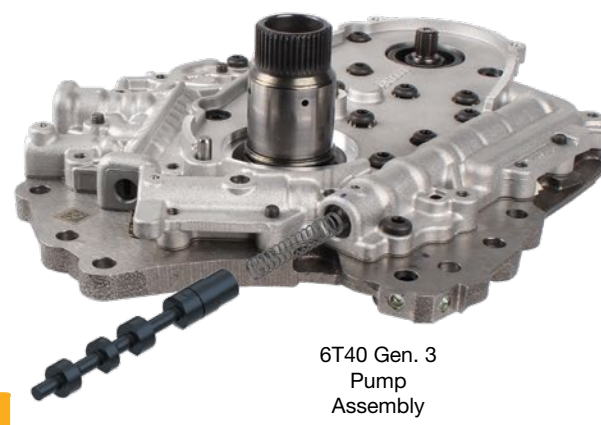
6T40 Gen. 3 Pump Assembly