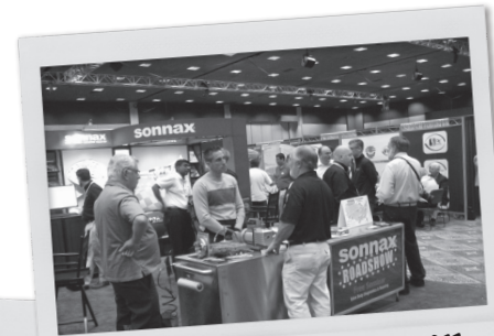
ATRA POWERTRAIN EXPO 2011

Roadshow presenters are drawn from the same team of experts who have made Sonnax products the industry's most trusted transmission solutions, people who understand and believe in a better, smarter approach to valve body repair and are excited to share their knowledge. They are happy to answer questions and work one-on-one with anyone who wants to try their hand at vacuum testing or valve body reaming on Roadshow equipment.