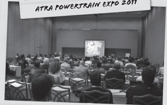
ROADSHOW SEMINAR AT ATRA POWERTRAIN EXPO 2011