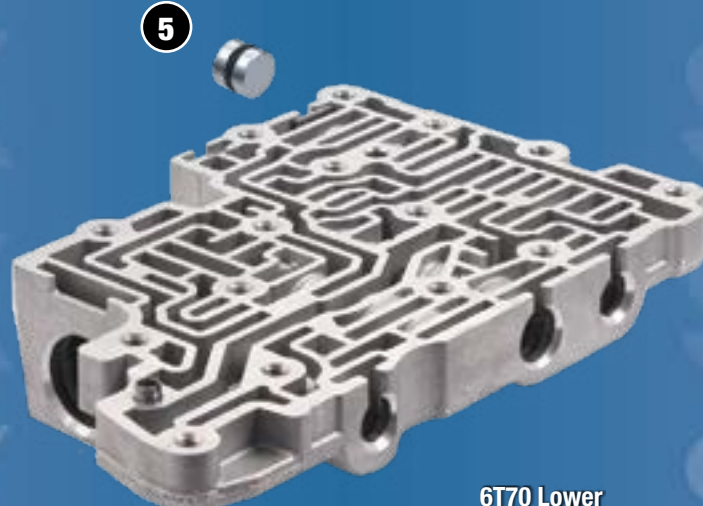
6T70 Lower Valve Body